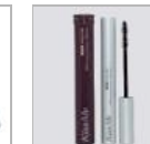
Kiss Me mascara