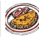
Greek egg-white omelette