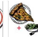
Pizza and Thai